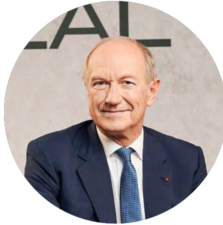
JEAN-PAUL AGON Chairman and CEO of L'Oréal

“The L'Oréal Group is particularly proud to be part of the founding team supporting the creation of this new Data Analysis and Artificial Intelligence (AI) Centre.