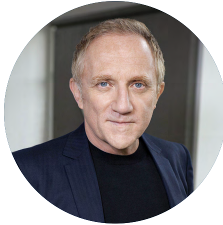
FRANÇOIS-HENRI PINAULT Chairman and CEO of Kering

“Kering has placed innovation at the very heart of its growth strategy and has developed a strong competitive advantage in the digital space of the luxury industry. In a constantly-evolving market, where customers are more and more connected, we are developing digital technologies and harnessing the power of Artificial Intelligence. These platforms are enabling our Houses to build increasingly personalized experiences for their customers and to increase the efficiency of their teams and operations. The data science hub we have developed at Group level and our entrepreneurial culture will be key to achieving our ambitions, and both will help to strengthen our leadership position in the use of digital platforms and AI.